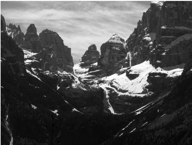
Fig. 1. Spectacular dolomites of the Brenta Group, Geopark Adamello Brenta, an open geological laboratory for appreciation and learning.