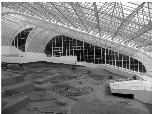
Fig. 2. Lepenski Vir archeological site and museum, included in the UNESCO World Heritage List.

4. The cultural value of geodiversity implies the significance placed by global society on some aspect of physical environment, such as mythology, archeological-historical, spiritual and aesthetic value (e.g. Lepenski Vir archeological site, NP Djerdap, eastern Serbia, Fig. 2).